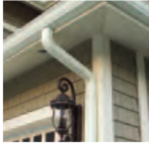
Rainware, Fascia, Soffit